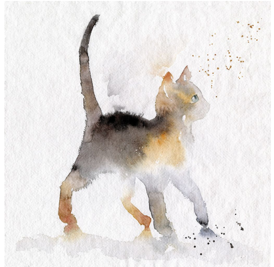
Field ontology - continuous

- fields \phi(\mathbf{x}) = (h(\mathbf{x}), \mathbf{A}(\mathbf{x}), \dots) at all space points \mathbf{x} .