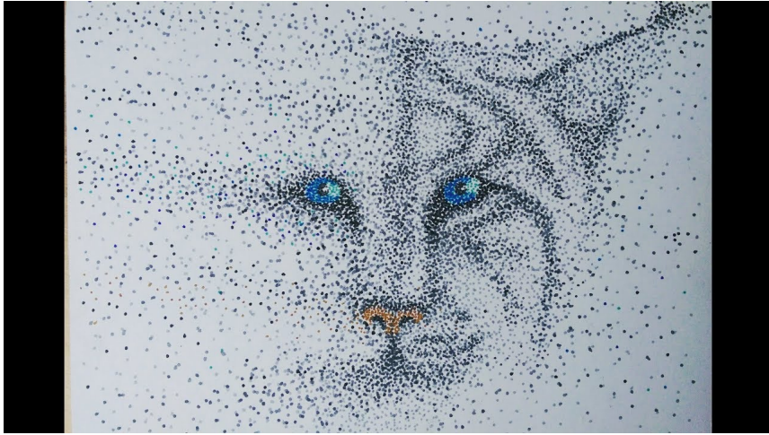
Particle ontology - discrete